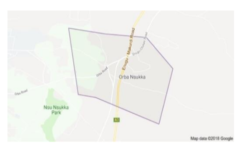
Orba in Udenu LGA Enugu Ezike in Igboeze LGA