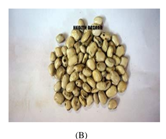
Figure 1: Mucuna seeds varieties (a = Pruriens and b = Veracruz)